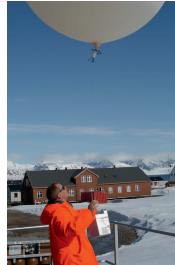
▲ Start of a balloon with an ozone radio sonde