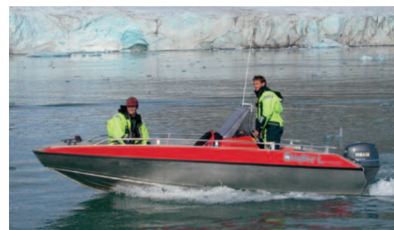
▲ One of the boats of the AWIPEV Research Base at a glacier front

Further geosciences work is done on the dynamics of the glacio-marine sediments on the southern