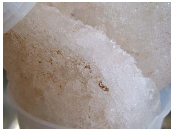
Fig. 1: Laguna ice with patchy sediment inclusions.

with a salinity of about 20. Patchy distributed inclusions of extremely fine grained, red-brown particles were visible in the ice (Fig. 1).