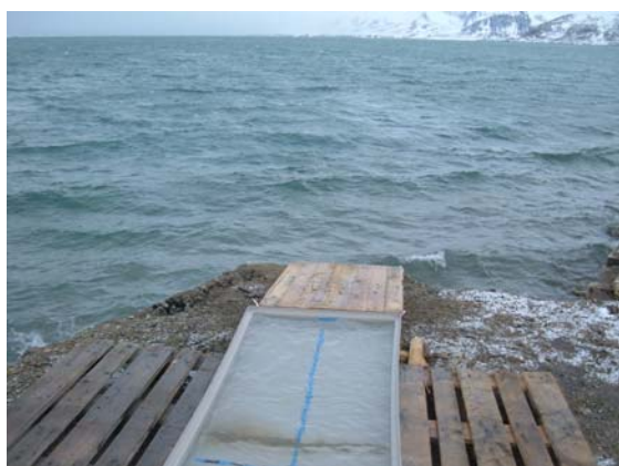
Fig. 2: Outdoor tank experiment to investigate Langmuir circulation parallelized to the natural occurrence of Lc indicated by streaks of surface floaters off Ny Alesund port.

Later, other scientists referred to this phenomenon proposed by pioneering Charles Langmuir. They gave more detailed face to this oceanographic mechanism conducting tank experiments, field investigations, mathematical approaches and modelling efforts. Thus, the standing term 'Langmuir circulation' (Lc) was born. Lc has enormous potential for the downward transport of momentum in the water column and, thus, wide influence on various processes like vertical heat and particle transport, oxygen ventilation, distribution and dislocation of planctic organisms, frazil formation and, finally, the entrainment of particles into newly forming ice.