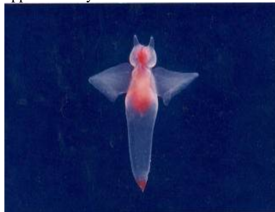
Clione limacina (max -85mm)

In Arctic waters, Clione limacina is found throughout the central Arctic Ocean, and its distribution extends southwards into sub-Arctic waters in both the North Atlantic and the North Pacific to approximately 30° to 40° N.