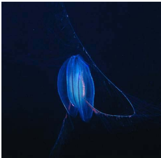
Mertensia ovum (max-80mm)

At this stage large chitinous hooks are everted from a pair of sacs, called hook sacs, and grasp the prey animal. It takes about 30-45 minutes for Clione limacina to pull Limacina helicina out of its shell and to swallow it whole. At this point it drops the empty shell. Is this less barbarous than Klingon behavior??