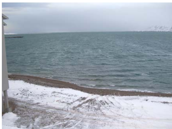
Fig. 1: Langmuir circulation in Ny-Ålesund port indicated by wind parallel surface streaks of foam.

Later, other scientists referred to this phenomenon proposed by pioneering Charles Langmuir. They gave more detailed face to this oceanographic mechanism conducting tank experiments, field investigations, mathematical approaches and modelling efforts. Thus, the standing term 'Langmuir circulation' (Lc) was born. Lc has enormous potential for the downward transport of momentum in the water column and, thus, wide influence on various processes like vertical heat and particle transport, oxygen ventilation, distribution and dislocation of planctic organisms, frazil formation and, finally, the entrainment of particles into newly forming ice.