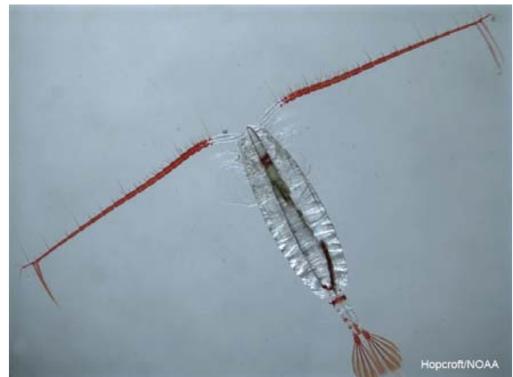
Calanus hyperboreus (max-5mm)

The ctenophore Mertensia ovum are a significant predator of other zooplankton species in the pelagic marine food chain. Mertensia ovum uses its extensive tentacles to entrap and ingest prey. Only few studies have reported on lipids and fatty acids of ctenophores in polar waters. Several authors determined high proportions of wax esters in Mertensia ovum from the Arctic. According to the analysis of fatty acid trophic markers, the major prey for M. ovum are herbivorous zooplankton, e.g. Calanus species.