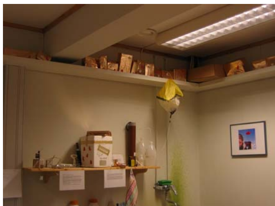
24 Ersatzteile für die täglichen Wetterballon-Aufstiege und Ozonsonden

freuen. Der grosse Container kam am 24. November an. Zarges-Kisten, wissenschaftliches Equipment und viele Kartons warteten darauf herumgeschleppt, ausgepackt, registriert und verstaut zu werden. Ausserdem hatte die Potsdamer Gruppe uns ein Paket mit Sondierungsmaterial zugeschickt. Es waren genau 24 Ersatzteile plus eine Spezial-Ozonsonde für die Adventszeit.