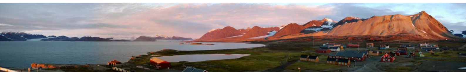
Panorama over Kongsfjord and Ny-Ålesund with Zeppelin mountain